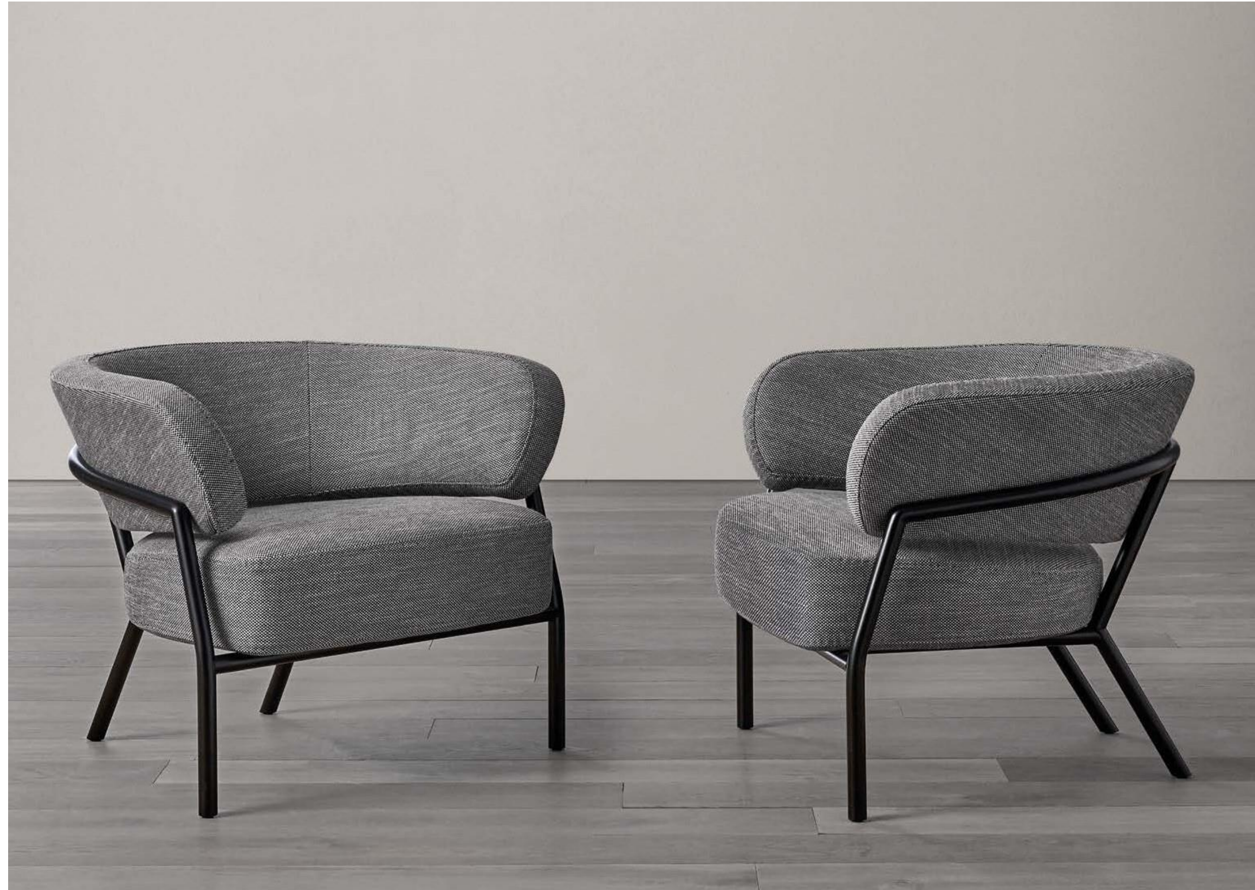
NANI poltrone . armchairs